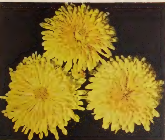
SULPHUR SPOON. 60c each; 3 for $1.50